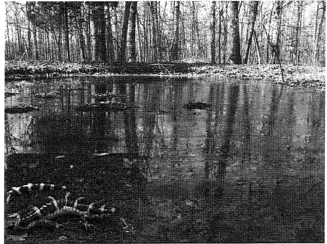
A constructed wildlife pond at the Daniel Boone Conservation Area, Warren County, Missouri. Inset of an adult ringed salamander, Ambystoma annulatum , that breeds predominantly in small forested ponds as shown here.

broader selection of alternative breeding sites, or somehow promote mate choice, oviposition, or larval survival.