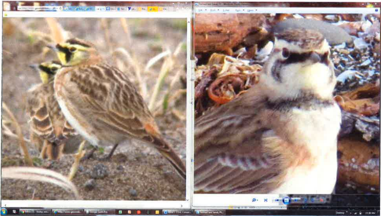
Pic on the left is a streaked horned lark, shown to compare with the bird on the right, which was observed at Sandy Point, WA.