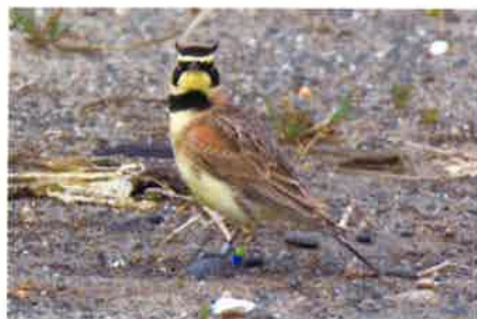
male SHL.jpg 110K