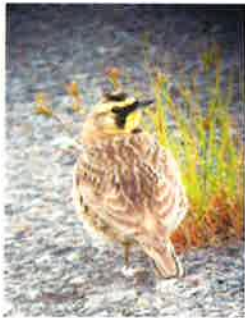
female SHL.jpg 224K