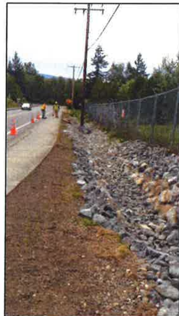
VELOCITY CONTROL AND BANK STABILIZATION PROJECT: AIRPORT WAY (ADJACENT TO RUNWAY).