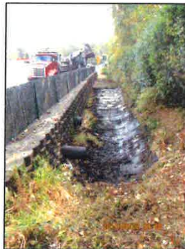
AIRPORT WAY/ BENNETT DRIVE RETENTION/ POND MAINTENANCE