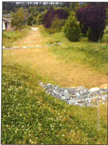
SILVER BEACH CREEK BIOINFILTRATION SWALE