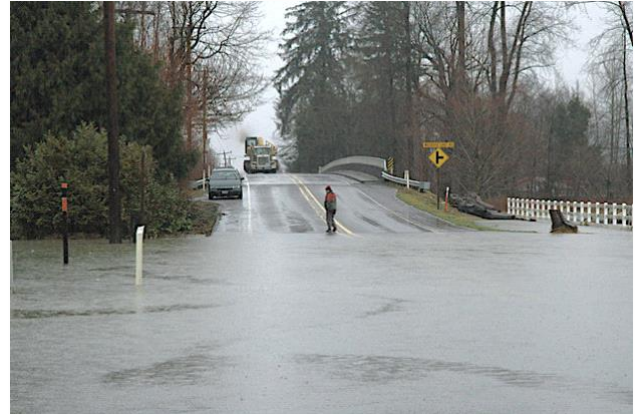
A citizen weighs whether or not to cross floodwaters rushing across SR 9 north of the Acme General Store (Whatcom County River and Flood)