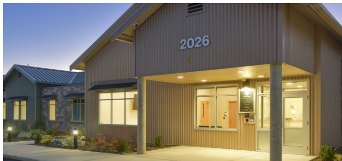
Current crisis stabilization center/Anne Deacon Center for Hope in Whatcom County.

Services that assist people released from jail to find things like jobs and housing and reduce the chance they will re-offend.