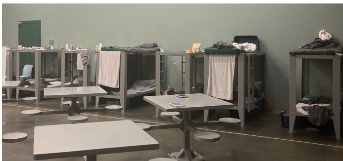
Work Center large dorm room.